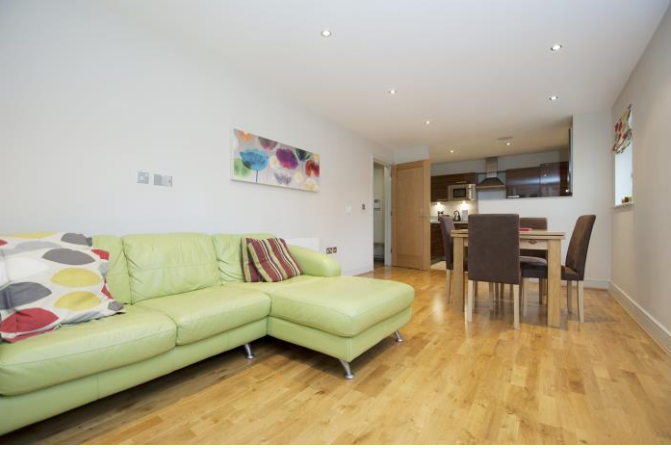
Consero Court, Weybridge, KT13 0RW